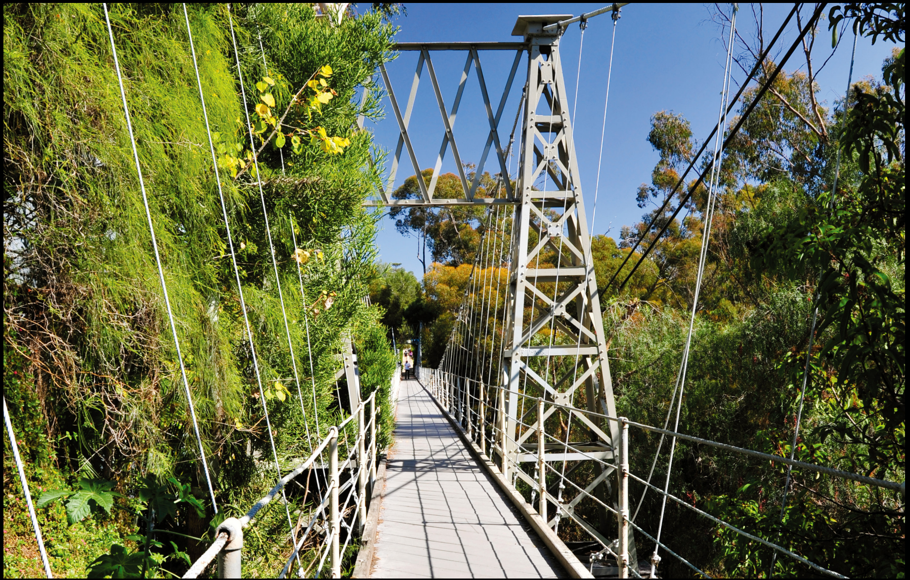
SPRUCE STREET SUSPENSION BRIDGE OVER KATE SESSIONS CANYON, 1912 EDWIN CAPPS