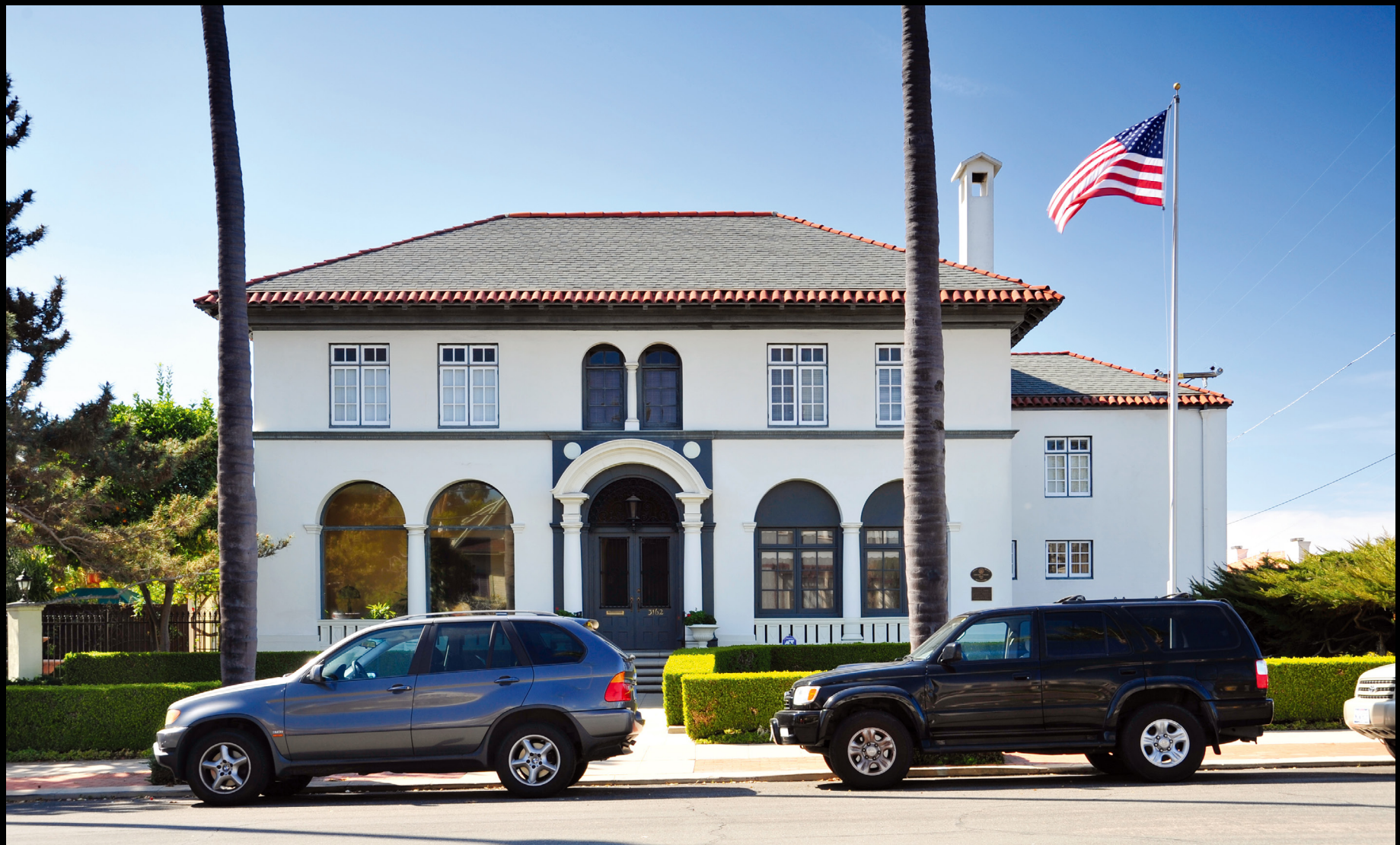
3162 2ND AVENUE - COULTER HOUSE, 1915 CARLTON MONROE WINSLOW COLONIAL REVIVAL