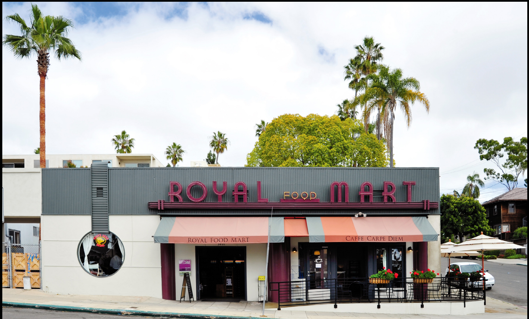
3401 1ST AVENUE - ROYAL FOOD MART, c. 1930 UNKNOWN ARCHITECT ART DECO