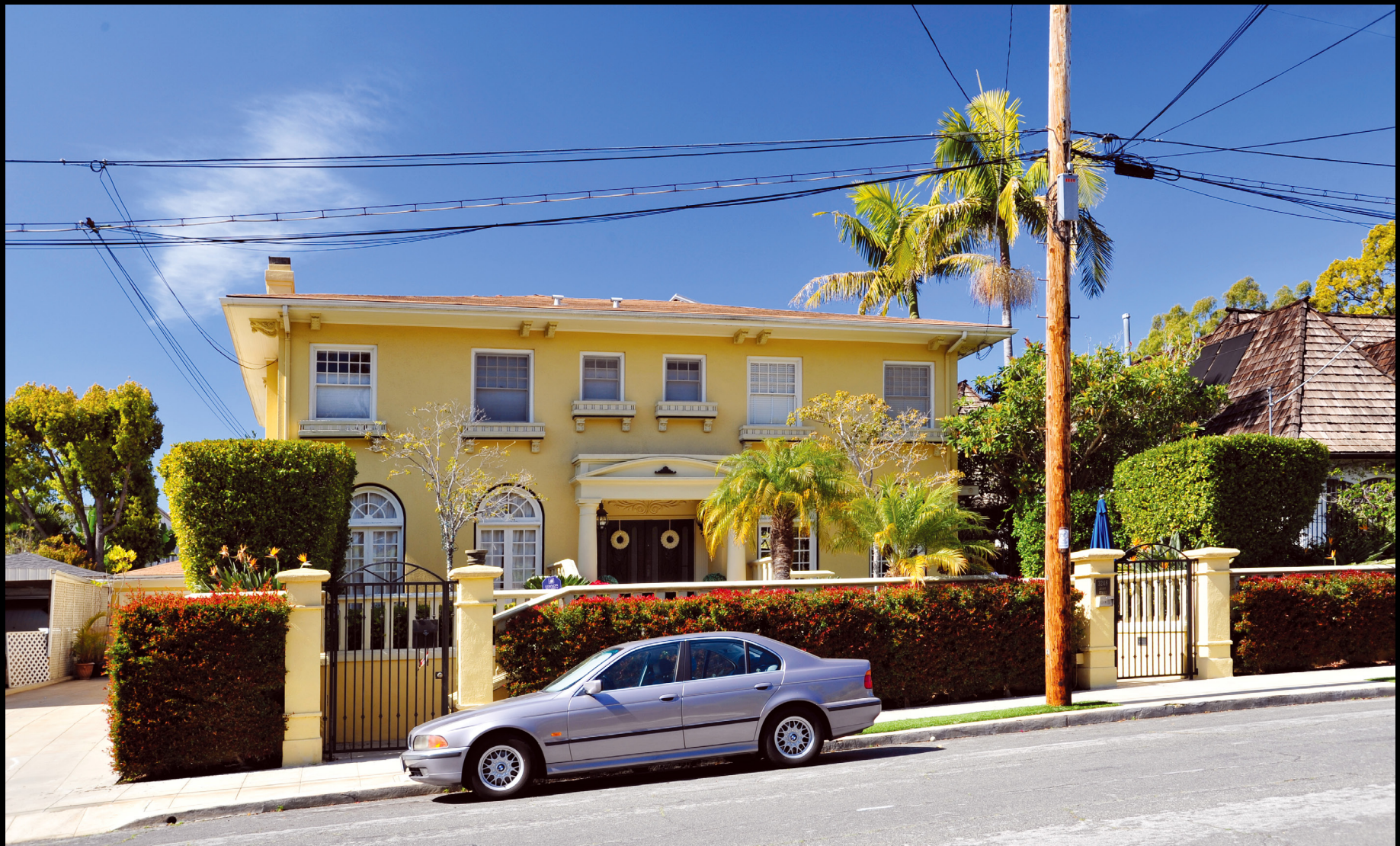
3248 BRANT STREET - LUCY KILLEA HOUSE, 1920 ALEXANDER SCHREIBER ITALIAN RENAISSANCE