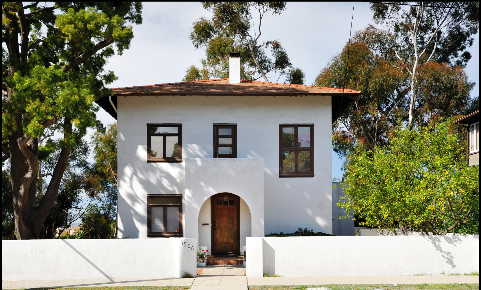
3506 ALBATROSS STREET - G.W. SIMMONS HOUSE, 1909 IRVING GILL CUBIST/EARLY MODERN