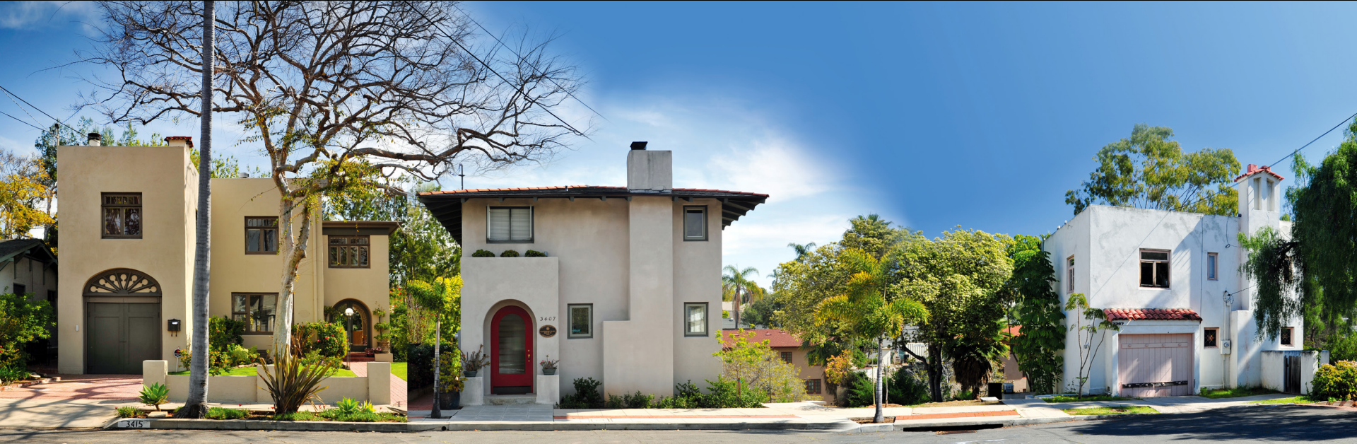
3415 ALBATROSS STREET KATHERINE TEATS HOUSE #2 CUBIST/EARLY MODERN