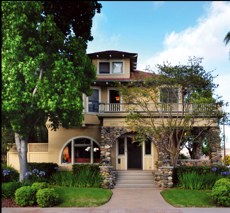
3303 2ND AVENUE MERZMANN-WINANS HOUSE, 1908 SCHANIEL BROTHERS CRAFTSMAN