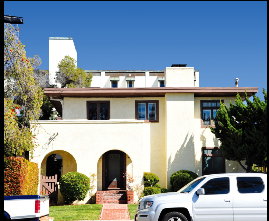
3353 2ND AVENUE GEORGE EASTON HOUSE, 1908 IRVING GILL CUBIST WITH PRAIRIE INFLUENCE