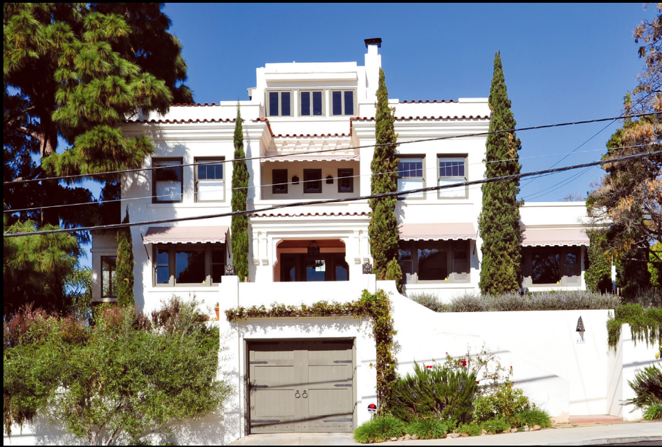
430 W. SPRUCE STREET RALPH D. LACOE HOUSE 1922 QUAYLE BROTHERS ITALIAN RENAISSANCE