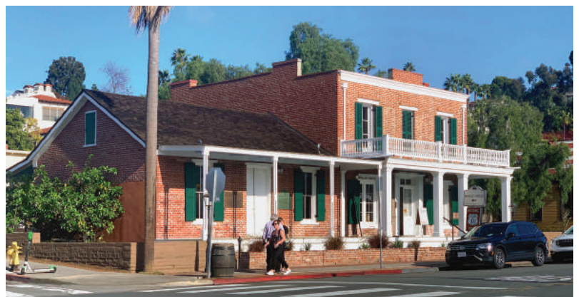
Historic photos courtesy SOHO