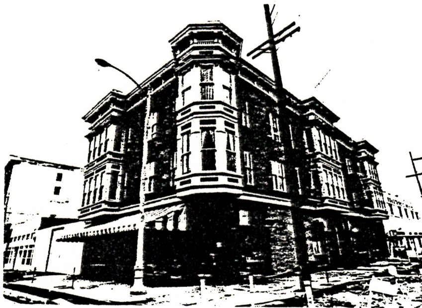
THE GRAND PACIFIC HOTEL - Southwest corner of Fifth Avenue & "J" Street