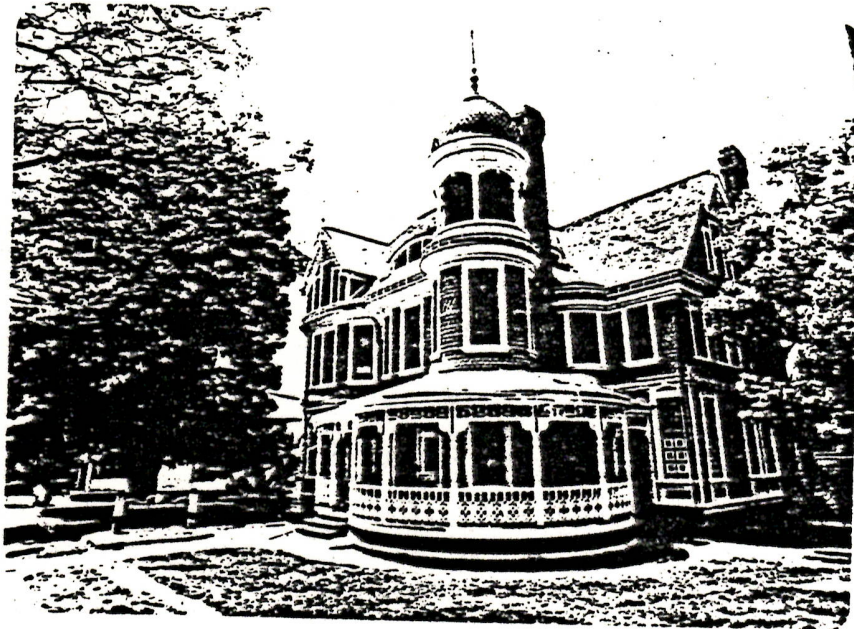
THE LONG-WATERMAN HOUSE