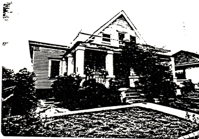
THE MATTHEW SHERMAN HOUSE - 418-422 19th Street