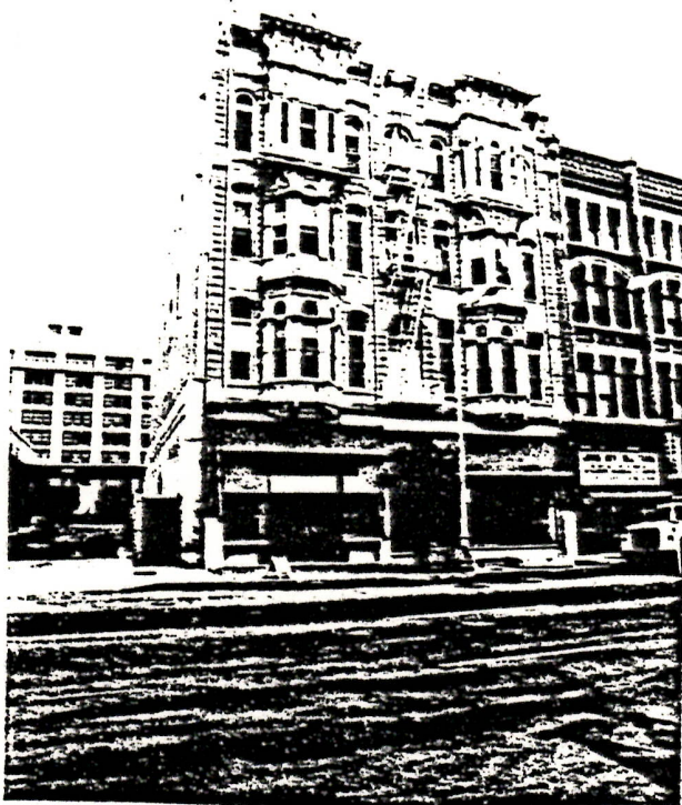
THE LOUIS BANK OF COMMERCE - 835 - 845 Fifth Avenue