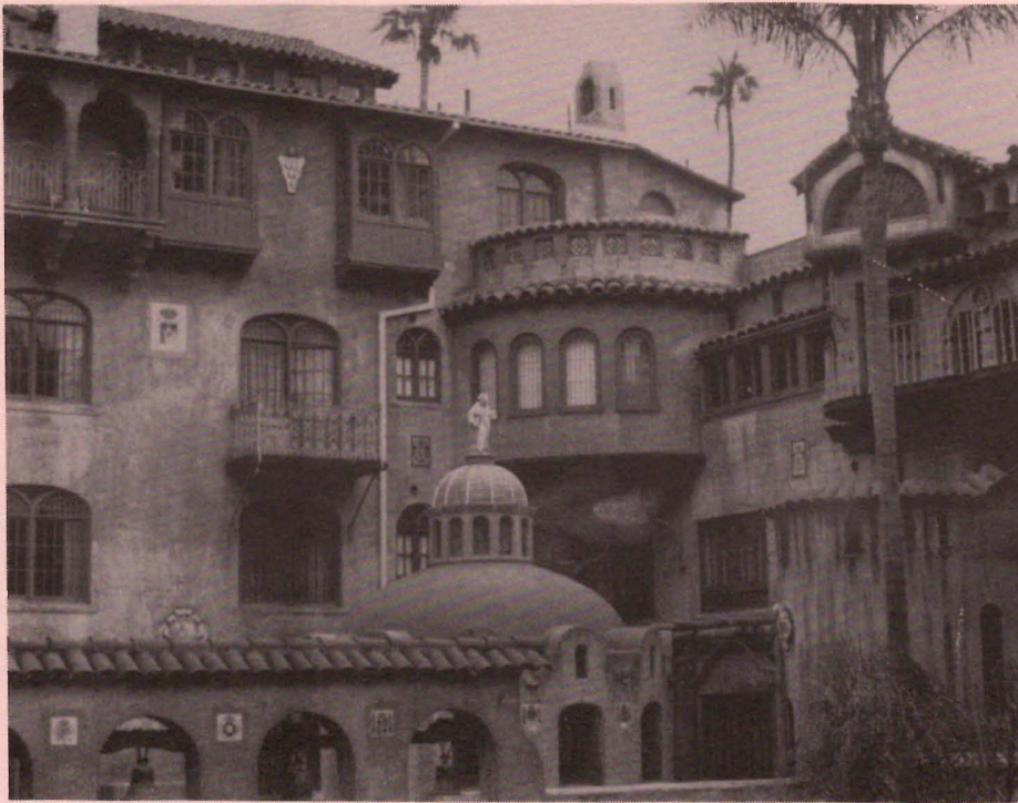
A view of the interior courtyard of the newly restored Riverside Mission Inn, site of the 20th annual meeting of the California Preservation Foundation.