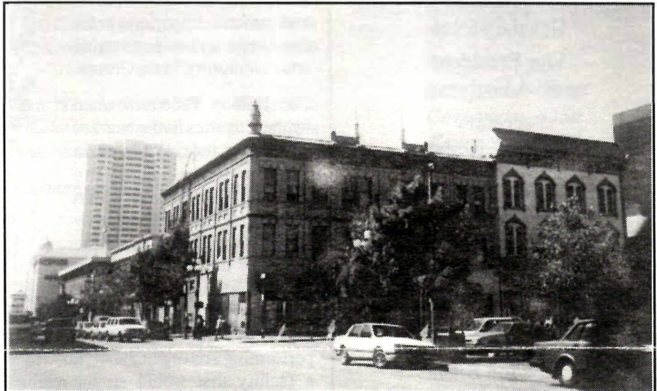
Looking westerly toward subject from G Street