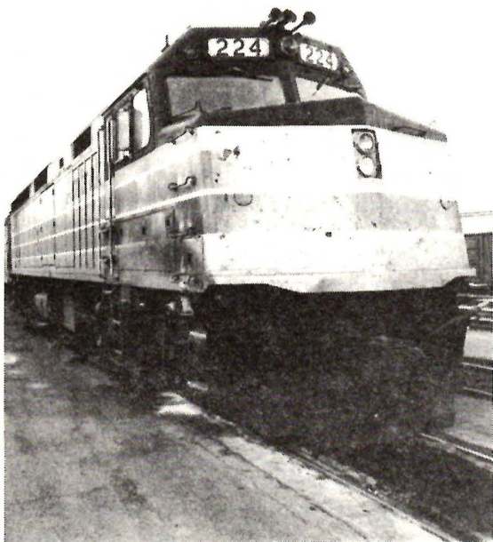
The Amtrak anxiously awaits its SOHO passengers.