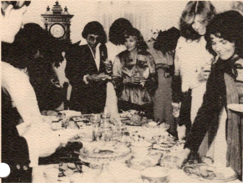
SOHO members making difficult decisions around the groaning hors d'oeuvres table.