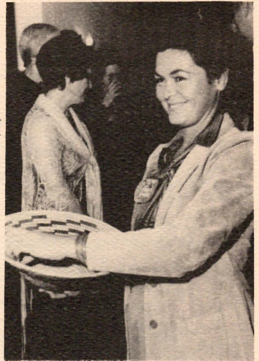
One of our lovely SOHO members helping with the door prizes.