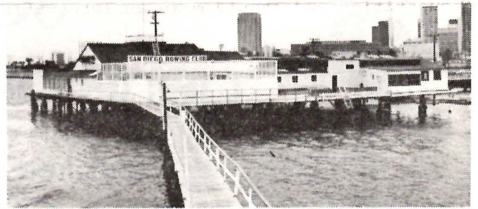
Historic Rowing Club. Note proximity to downtown