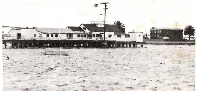
Clubhouse houses all wooden racket ball courts inside