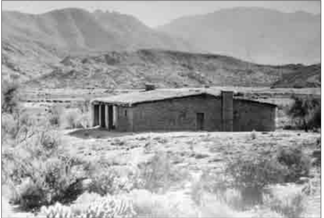
The restored Butterfield station at Vallecito, circa 1940. Today it is a San Diego County park.

best man, or rather, the best animal foremost. We were scattered all along the way, and the last of the company did not get up for two hours after the first. We reached this point at 11 A.M. The water, though clear as crystal, has a peculiar and unpleasant taste. We ate a piece, but we could find nothing for our animals to feed upon. There are a large number of Seniorians [ sic ] encamped here, resting their stock, before they undertake crossing the desert. . . . They gave us glowing accounts of the gold diggings, and had large quantities of the dust in their possession. This appears to be a general encamping place, but the stench arising from the number of dead animals strewn about is almost sickening. Packed up and left Carrizo creek at 3 o'clock P.M. Traveled up a narrow valley in a N.W. direction. The mountains on either side have a barren aspect, and the only vegetation in