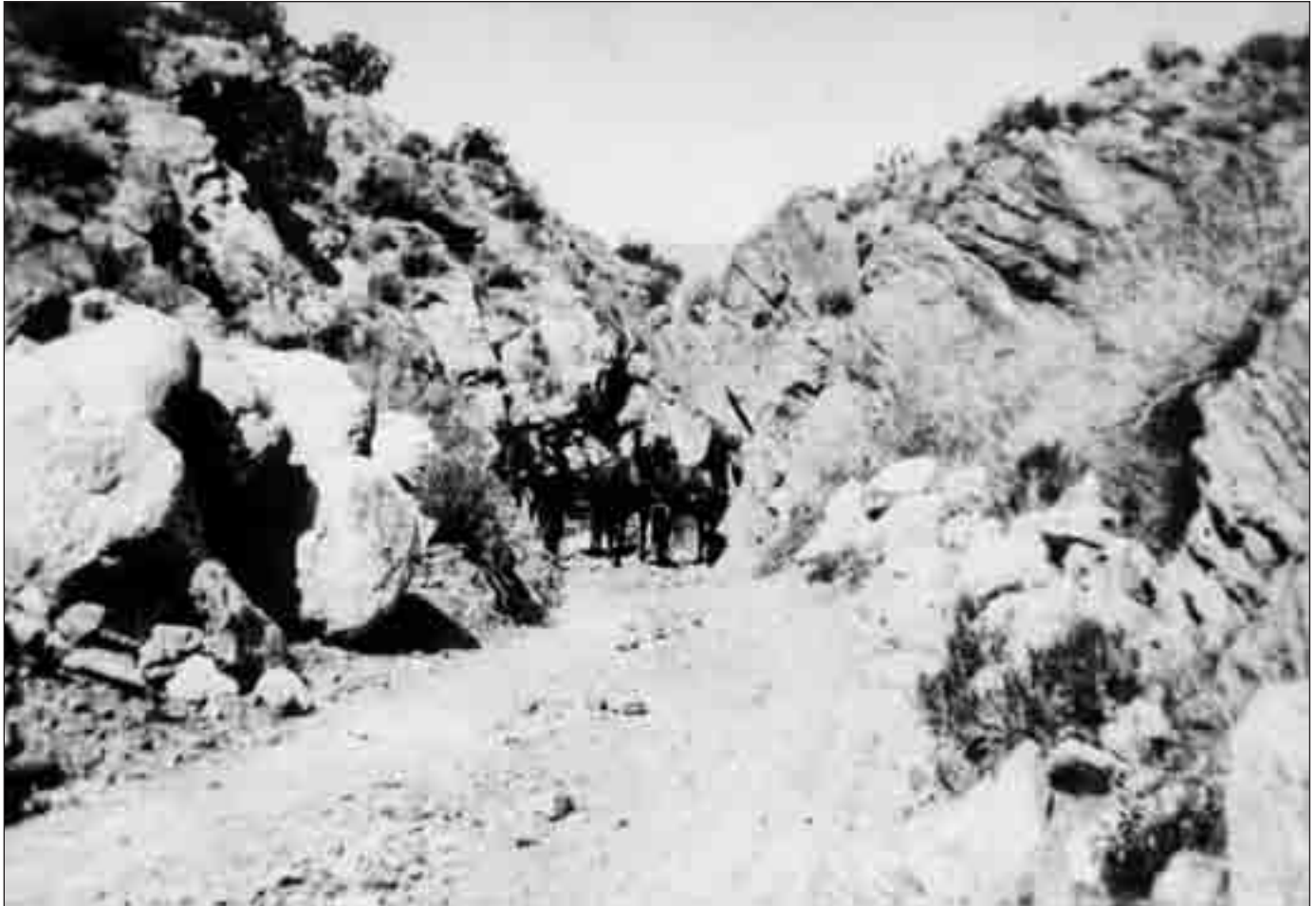
Box Canyon, 1912. This narrow cut between Mason Valley and Blair Valley, on the Anza-Borrego Desert, was one of the most notorious stretches of the Southern Emigrant Trail.