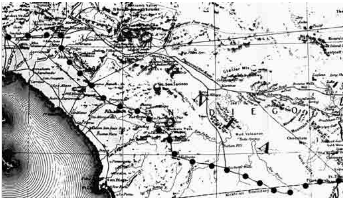
The Southern Emigrant Trail (highlighted) as shown on “Bancroft’s Map of the Colorado Mines,” published in 1863.

proposed that a garrison be stationed at Vallecito, in hopes of reviving the overland route to Mexico. But with the Yuma Crossing still closed to the Spanish, nothing came of the plan.