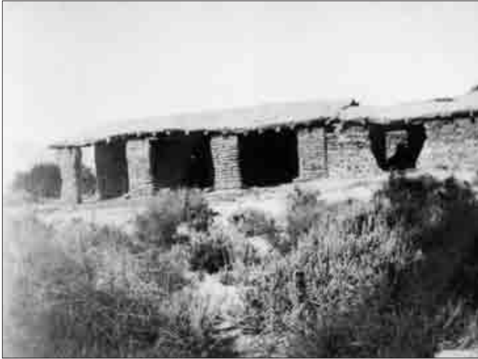
The ruins of the old Butterfield station at Vallecito, circa 1912.

The first of several ferry boat operations at Yuma was established at the beginning of 1850. It was soon taken over by what historian Arthur Woodward called “a gang of greedy, unscrupulous hoodlums” who were all murdered in April 1850. 12