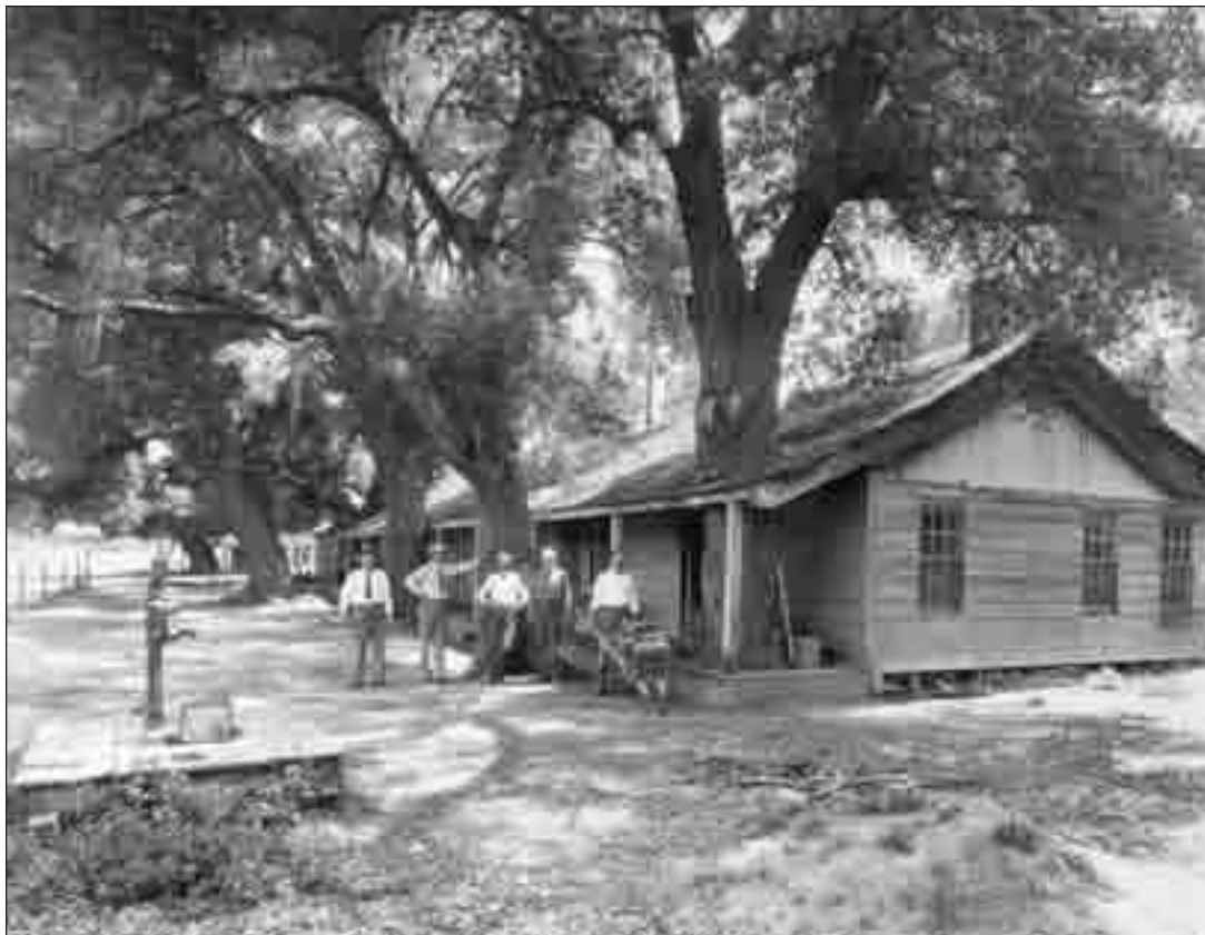
The old Butterfield stage station at Oak Grove as it appeared in the 1930s. It still stands today along Highway 79, south of Temecula.