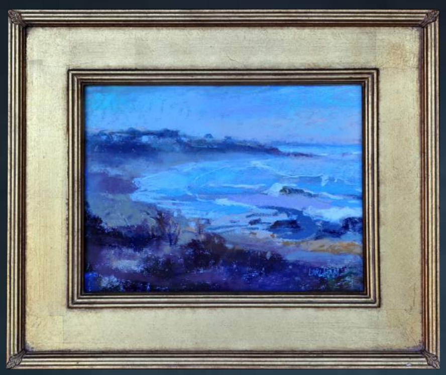
Misty Bay Cambria Pastel - 9" x 12" $325