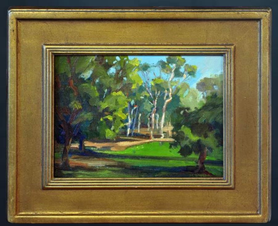
Morley Field Oil on Linen Panel - 9" x 12" $425