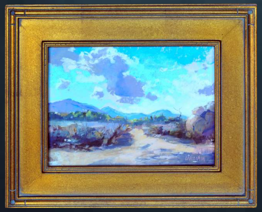
Hanging Out, Wright's Field, Alpine Pastel - 9" x 12" $425