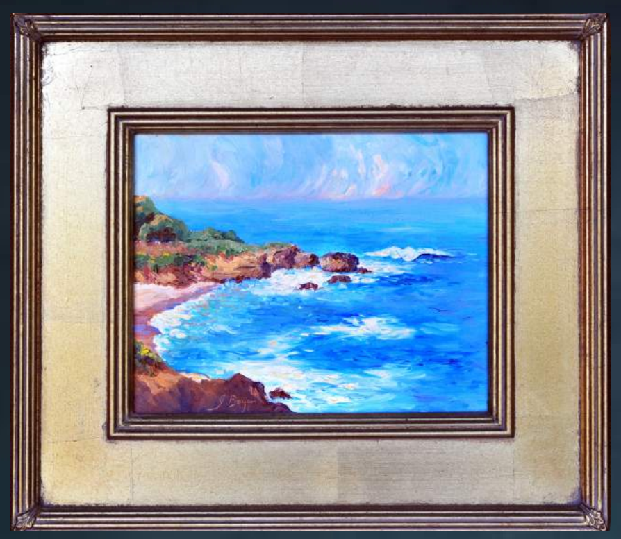
The Cove, La Jolla Oil - 8" x 10" $390