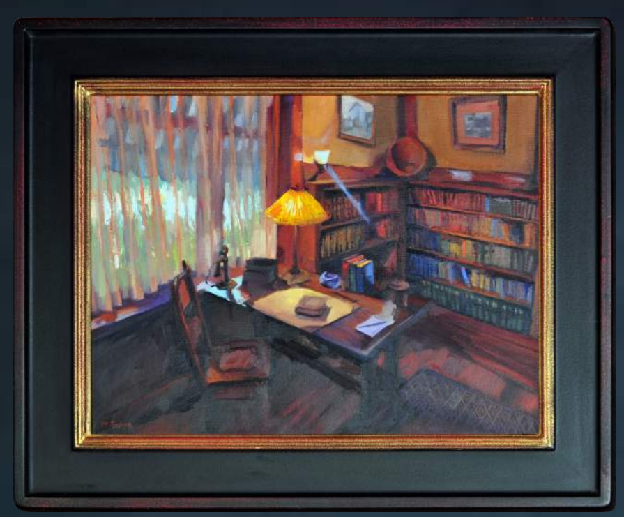
The Library, Marston House Oil on Linen - 18" x 24" $1,400