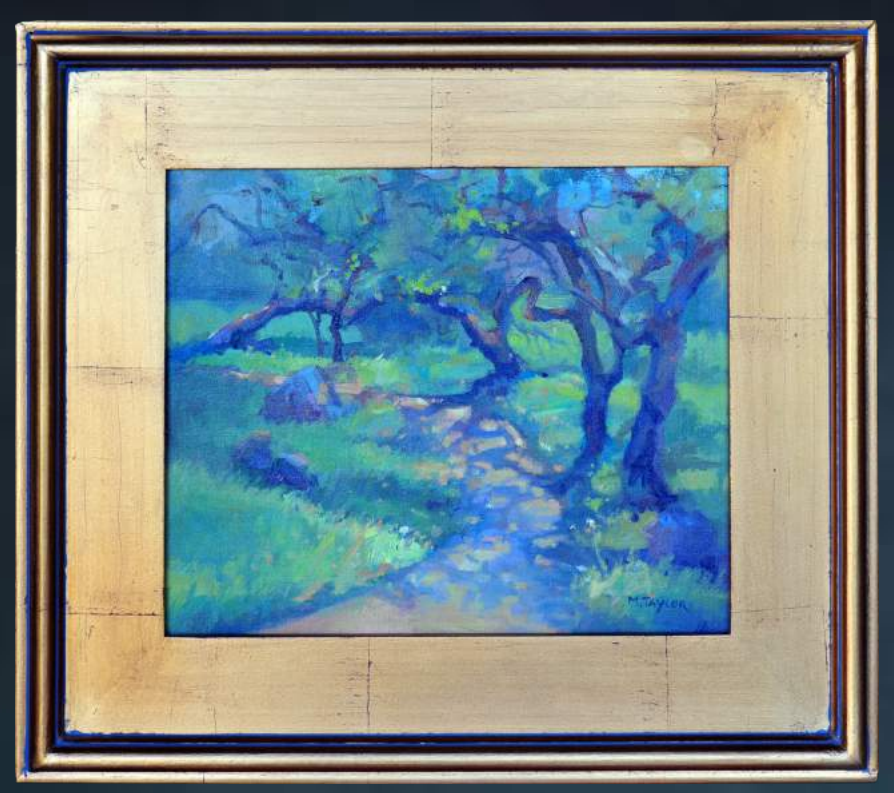
Eureka Ranch Trail Oil on Linen Panel - 10" x 12" $450