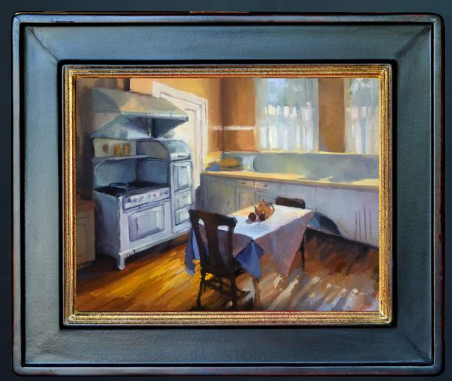
The Kitchen, Marston House Oil on Linen - 18" x 24" $1,400