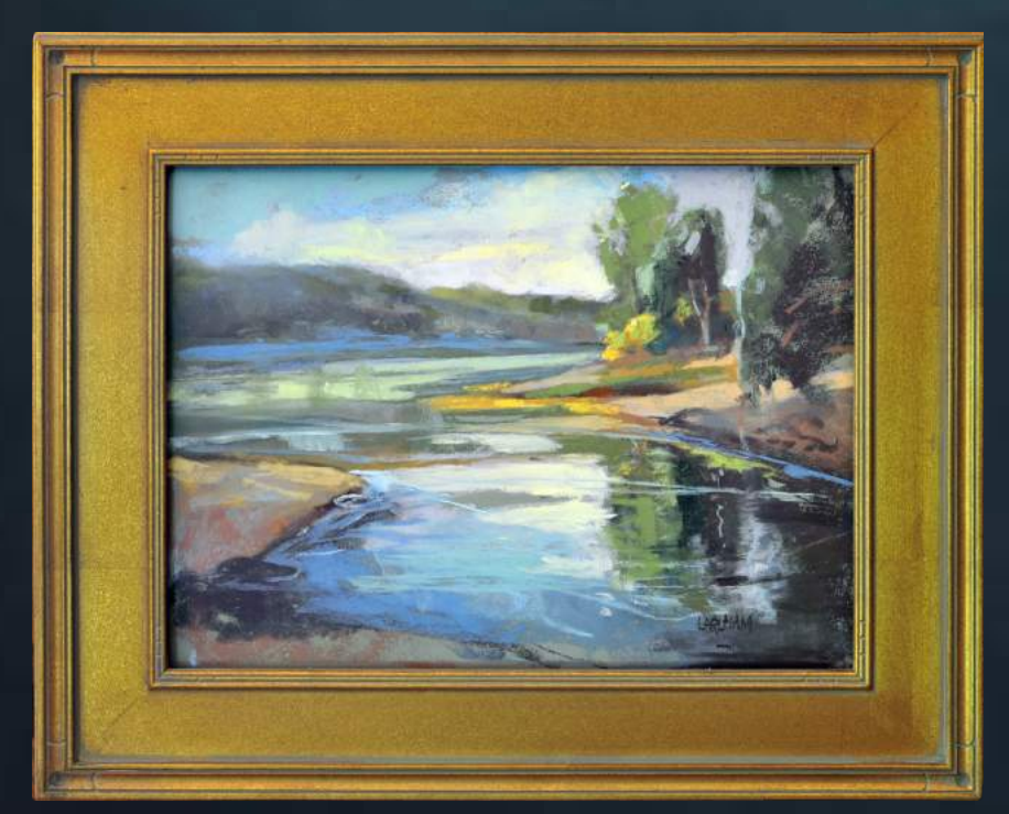
Limpid Eye of the Lake Pastel - 12" x 16" $600