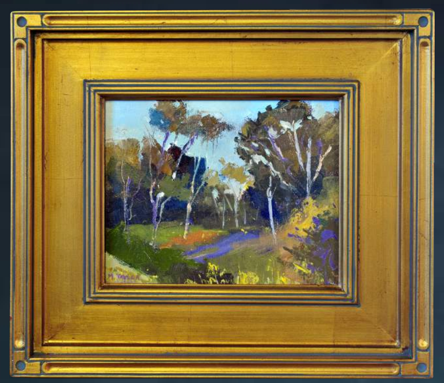
Dance of the Eucalyptus Oil on Linen Panel - 8" x 10" $375