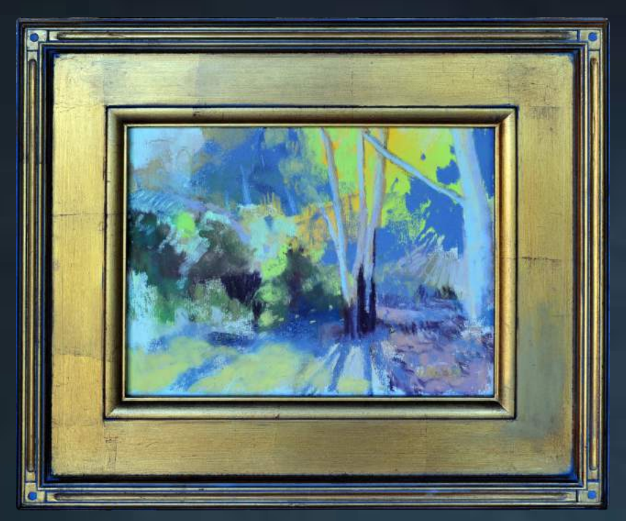
Sunshine Grove/Shepherd's Canyon, Mission Trails Pastel - 9" x 12" $425