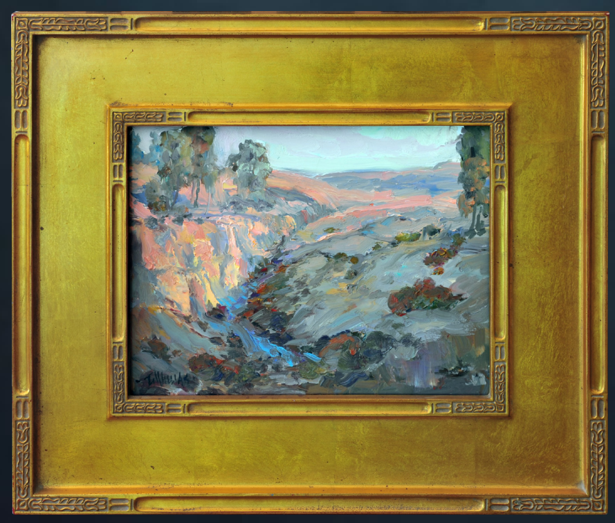
San Dieguito Park, North County Oil on Archival Board - 22" x 28" $2,400