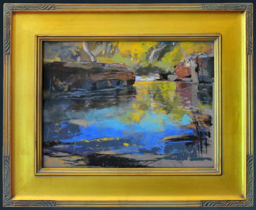
Gleam, Mission Dam Pastel - 12" x 16" $600