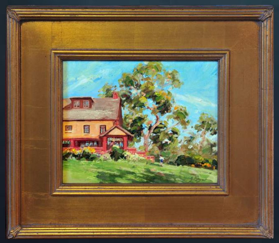
Marston House View Oil on Canvas - 14" x 16" $390