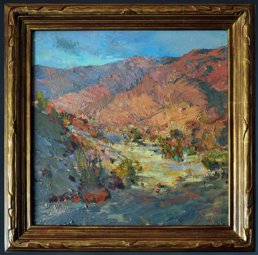
Glorietta Canyon, Borrego Springs Oil on Archival Board - 17.75" x 17.75 $1,200