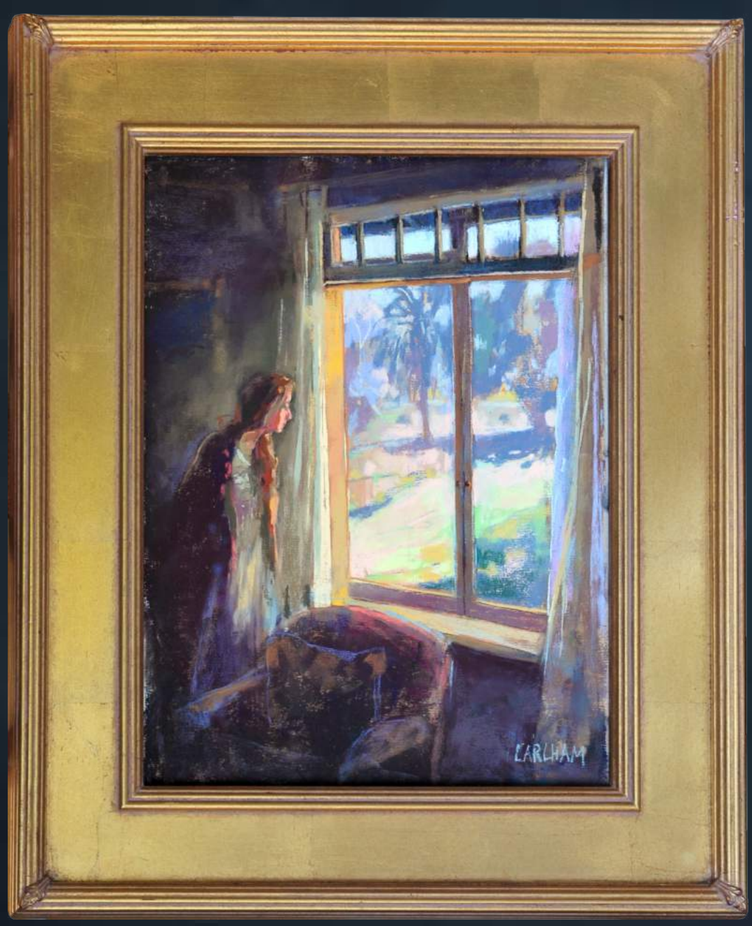
Curiosity/Marston House Pastel - 16" x 12" $500