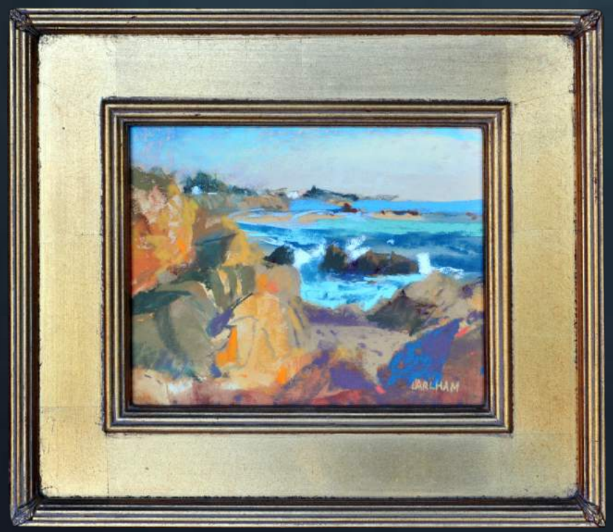
California Coastal Cambria Pastel - 8" x 10" $300