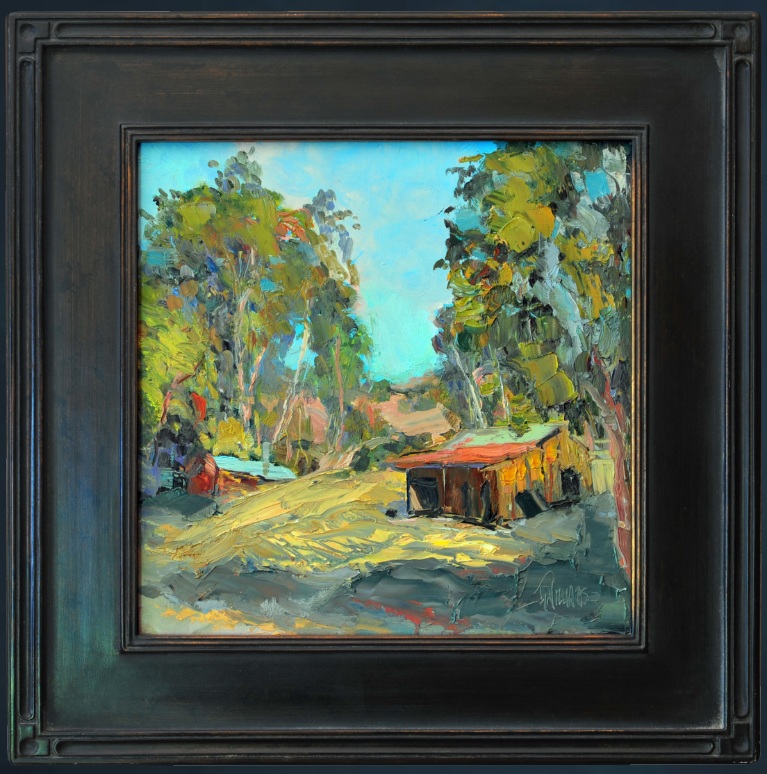
Old Ranch off Hwy 76 East Oil on Archival Board - 17.25" x 17.25" $500