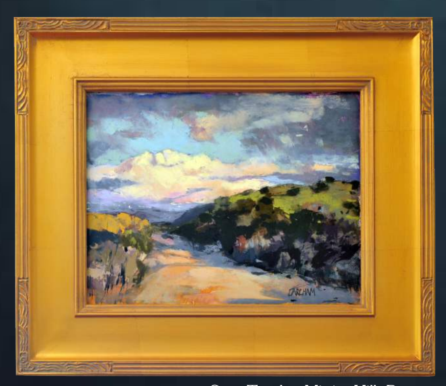
Come Together, Mission Hills Preserve Pastel - 11" x 14" $525