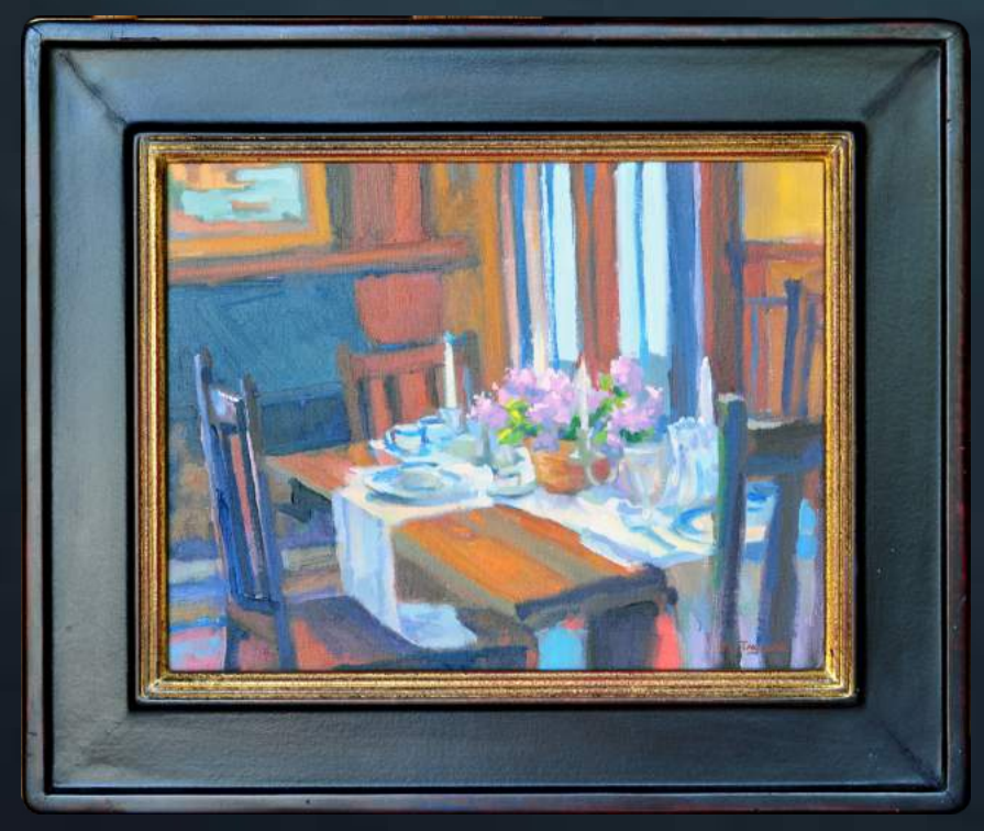
Set for Dinner, Marston House Oil on Linen - 11" x 14" $495