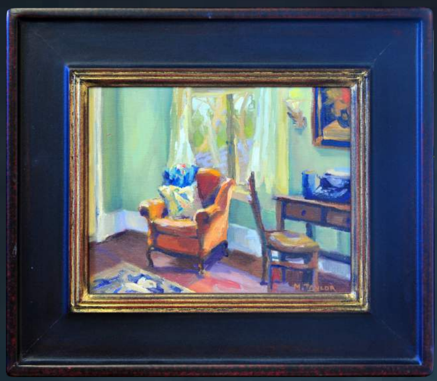
Morning Light Oil on Linen - 8" x 10" $375