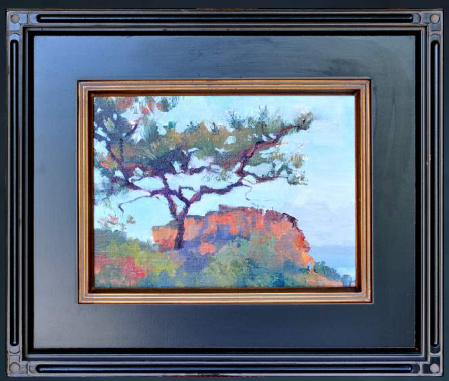
Iconic and Endangered Oil on Linen Panel - 9" x 12" $425