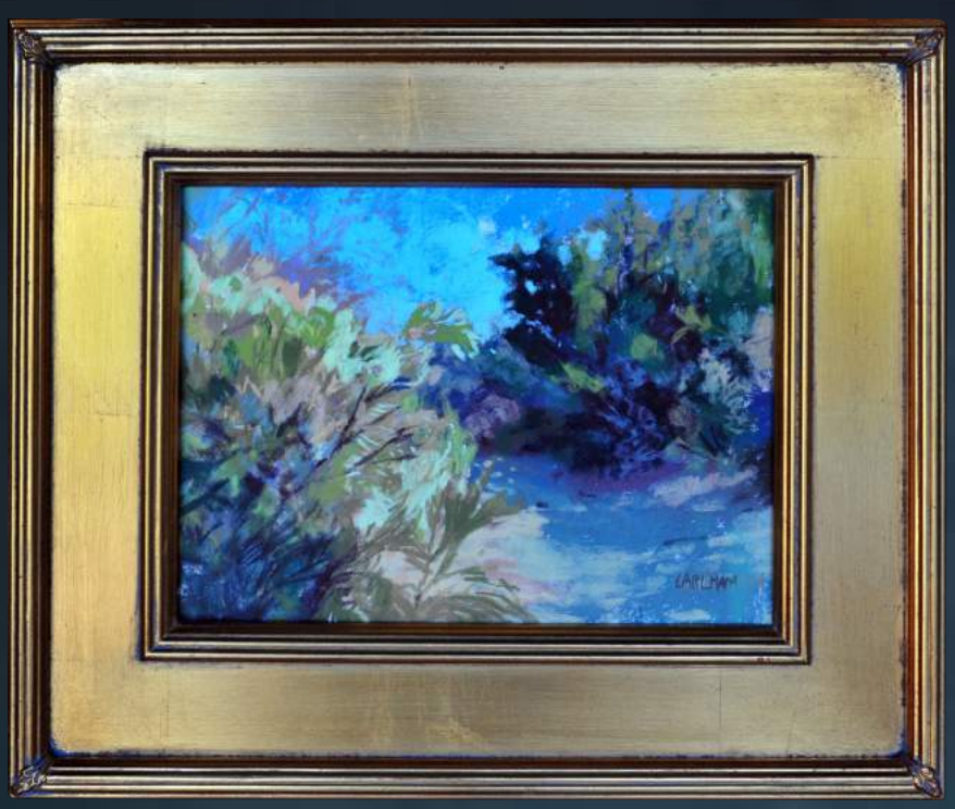
Feathery Path, Mission Trails Preserve Pastel - 9" x 12" $425