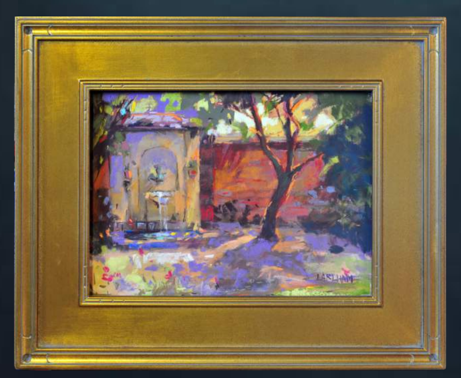
Walled Garden, Marston House Pastel - 9" x 12" $425