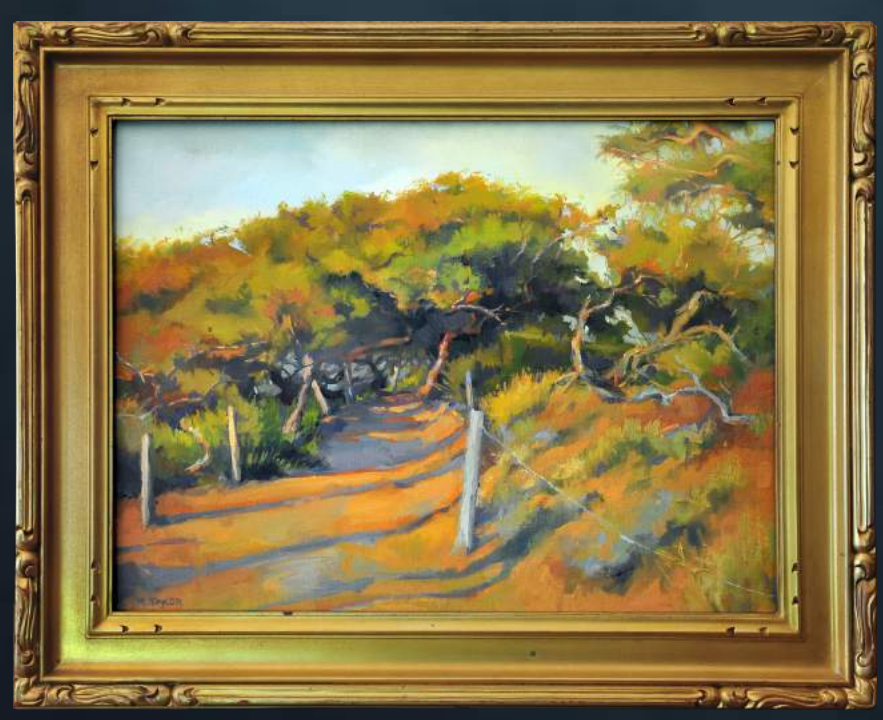
Torrey Pines Path Oil on Canvas - 24" x 30" $2,100