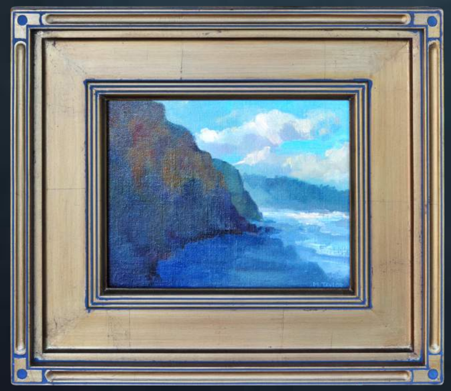
Early Morning, Torrey Pines Beach Oil on Linen Panel - 8" x 10" $375