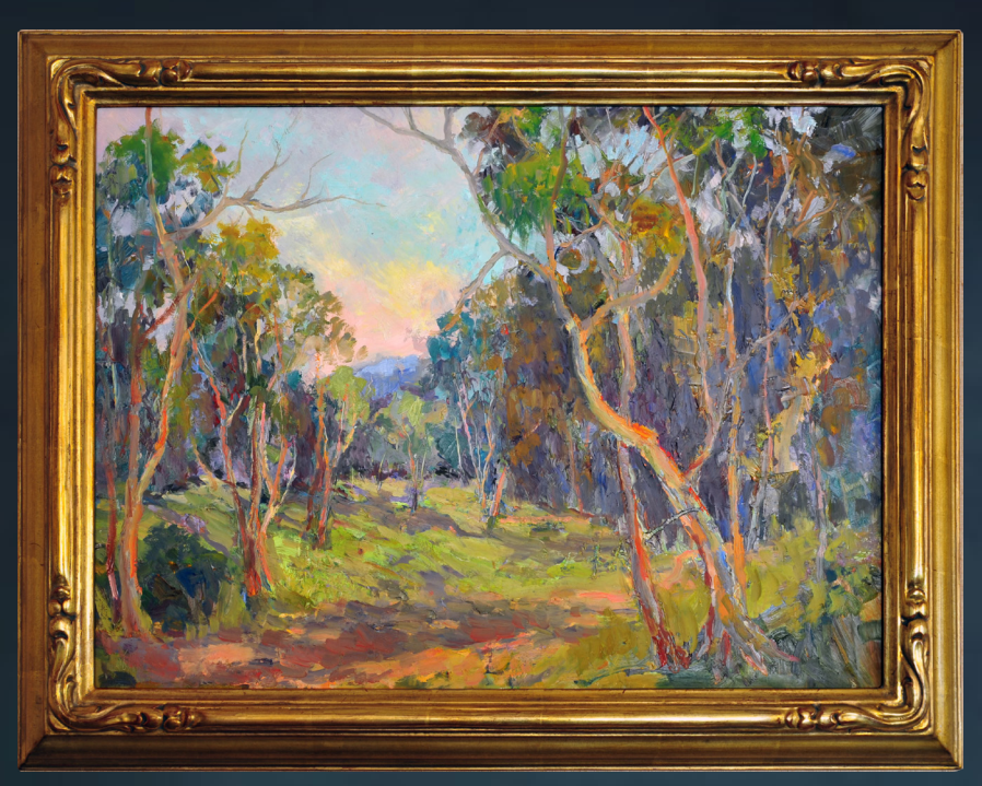
Hollister Ranch, Santa Barbara County Oil on Archival Board - 22" x 28" $2,400