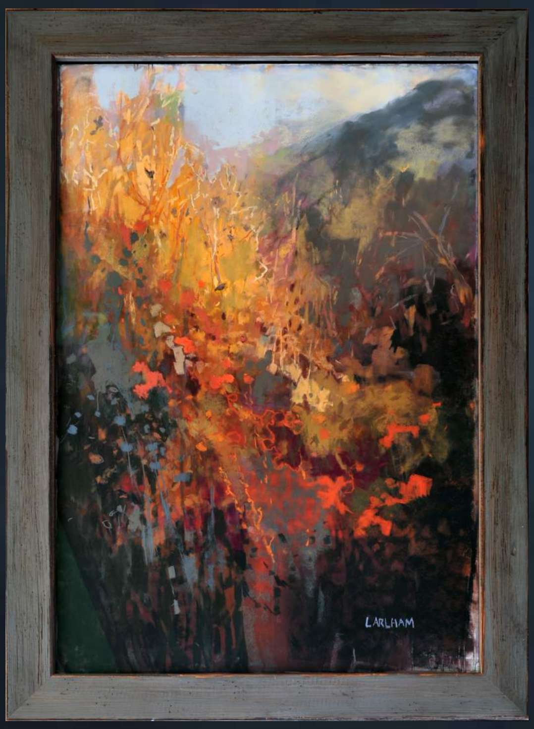
World According to Sparrows Pastel - 36" x 24" $2,000