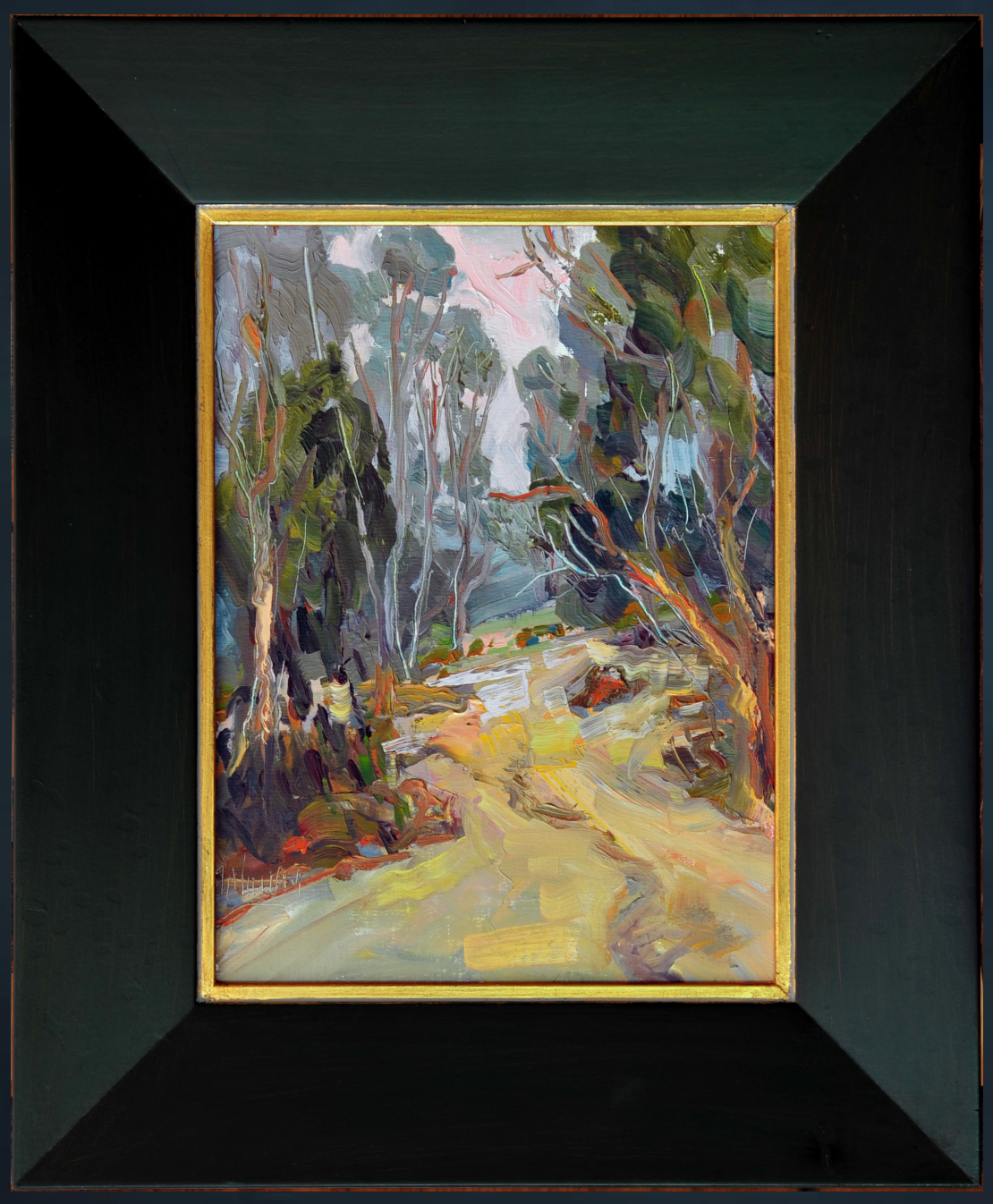
Gray La Jolla Oil on Board - 17.5" x 14.5" $475