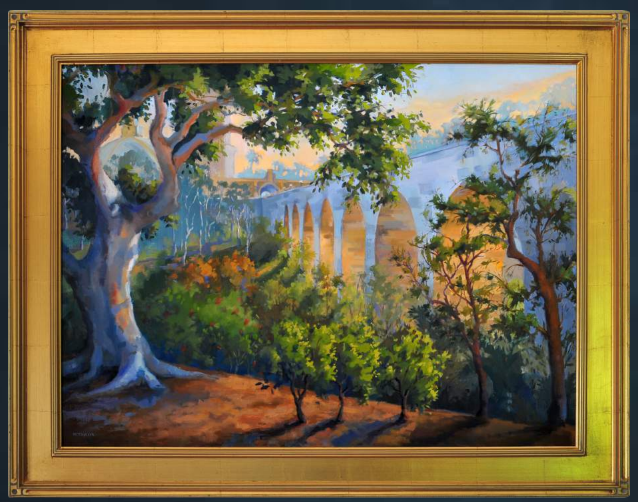
View from the North Side Oil on Linen - 30" x 40" $3,600