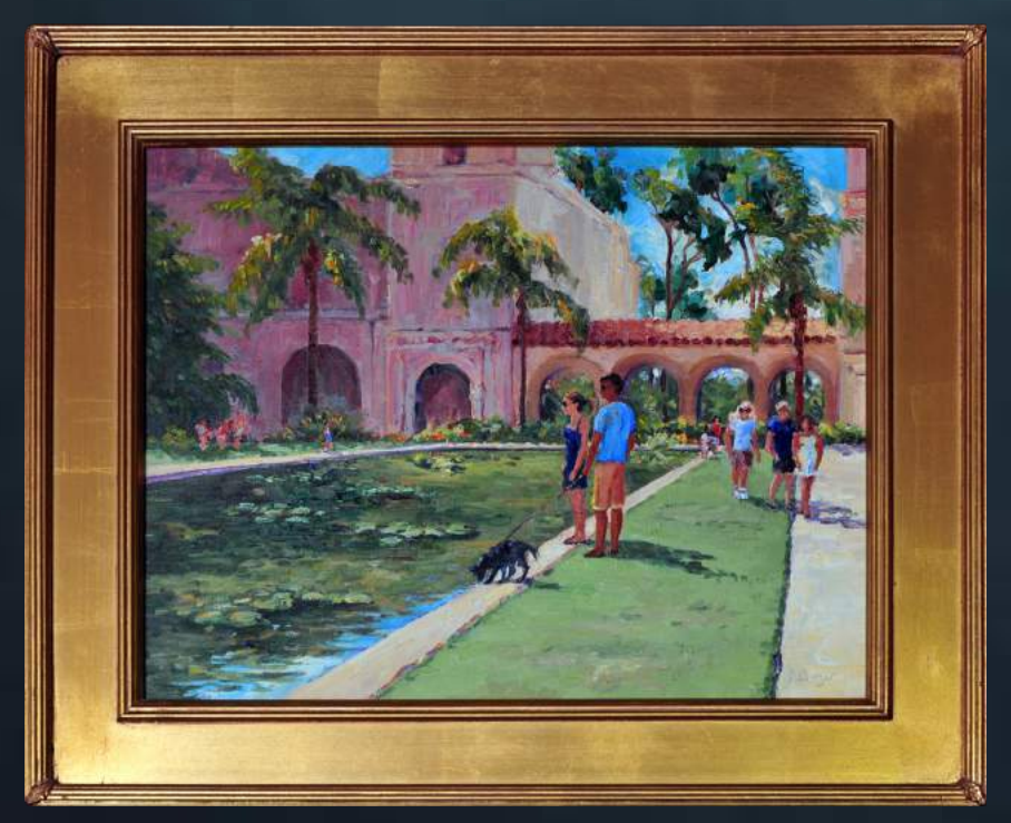
Lily Pond Centennial Oil on Canvas - 16" x 20" $900