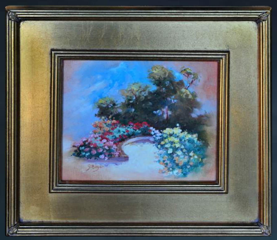
Rose Garden in Balboa Park Oil on Canvas - 8" x 10" $390