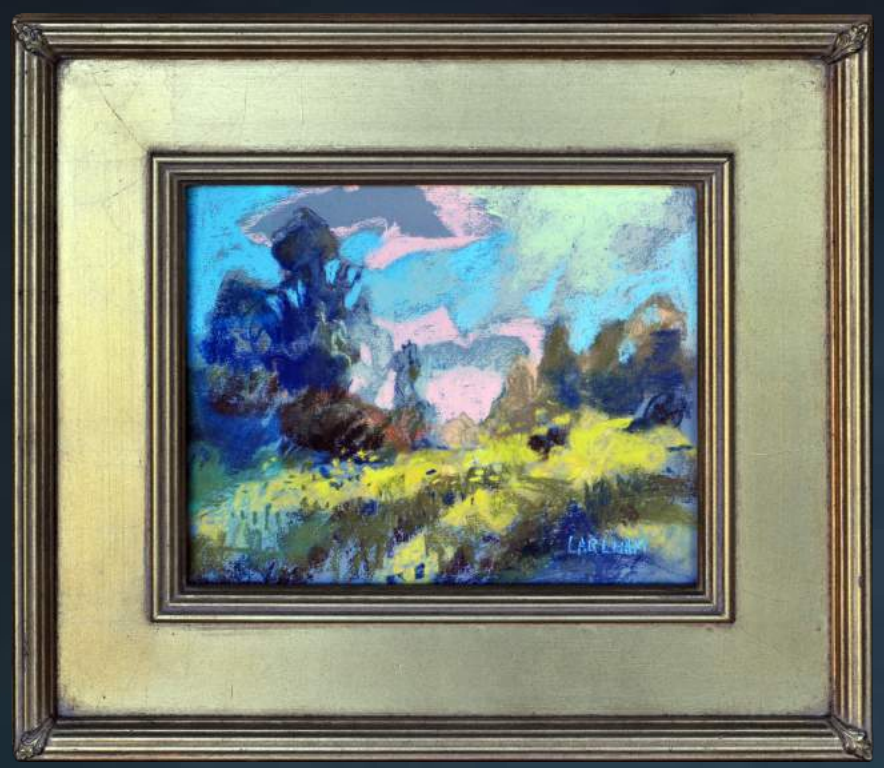
Spirit Rising Pastel - 8" x 10" $250