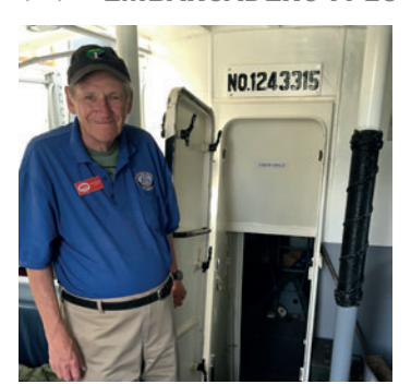
A throwback to the days of Vietnam