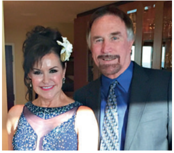
Local couple makes a difference