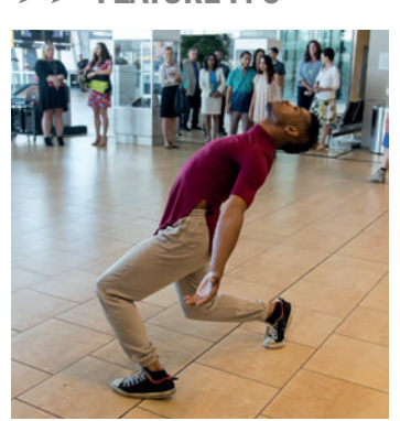
Dancers at the airport