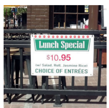
Are you in compliance?