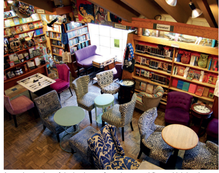
A crow's eye view of the bookstore from the second floor, which has been upgraded

Upstart Crow Bookstore & Coffee House, a 25-plus-year fixture in San Diego's Seaport Village, announced on Dec. 5 its planned closure by the end of that month. It was going the way of countless small independents before it, succumbing to the book sales behemoth, Amazon.com, and a national coffeehouse chain that had