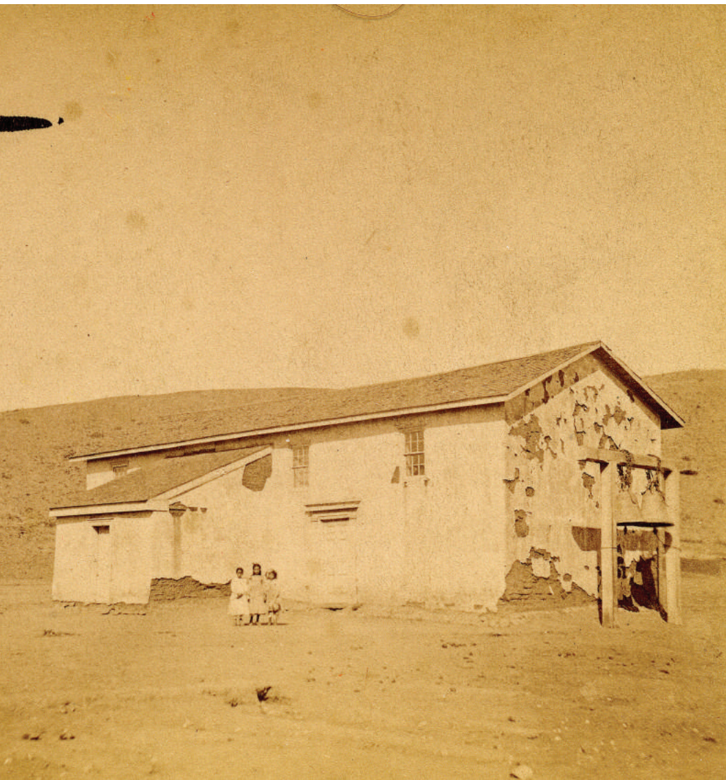
An early 1870s exterior view from the southwest shows deterioration of the chapel's adobe walls. The bells from the San Diego mission can be seen hanging from a post and lintel wood structure.