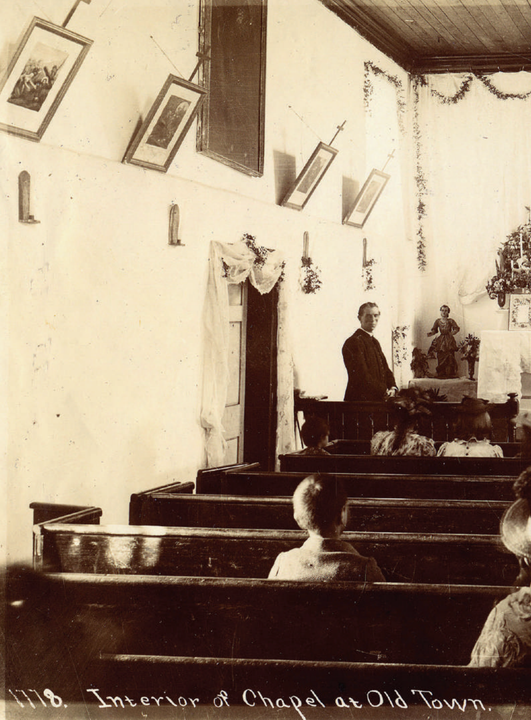
1118. Interior of Chapel at Old Town.