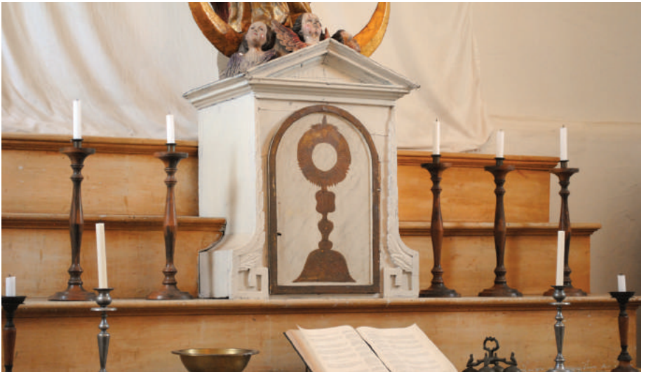
Adobe Chapel Tabernacle, c. 1769

Wood • Original faux painted marble still discernible under a later paint over 31.25" x 25.25" x 18"