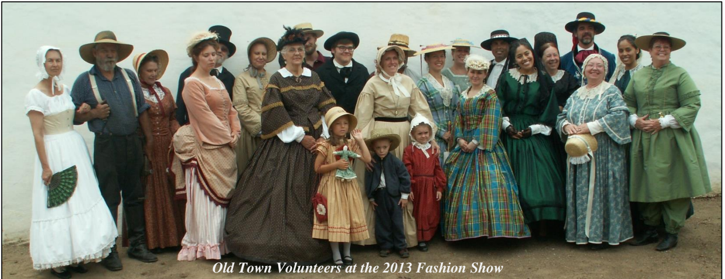
Old Town Volunteers at the 2013 Fashion Show