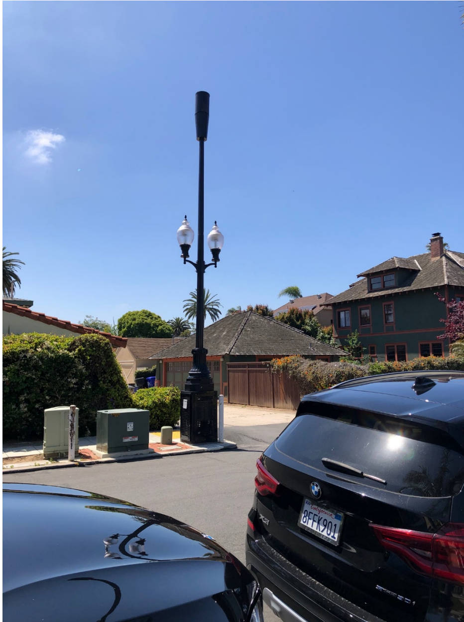
Trias Street and Fort Stockton Drive

Right-of-way installations that do not qualify as SC-WCFs, adjacent to any type of development that do not have any type of ground mounted equipment other than the pole to which the WCF is attached to or concealed within. Supplemental NUP findings are required.