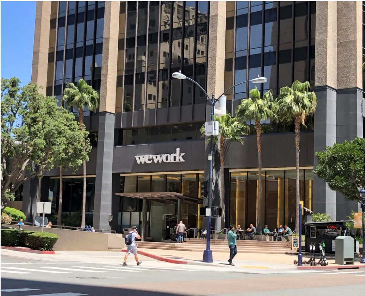
6 th Avenue and B Street