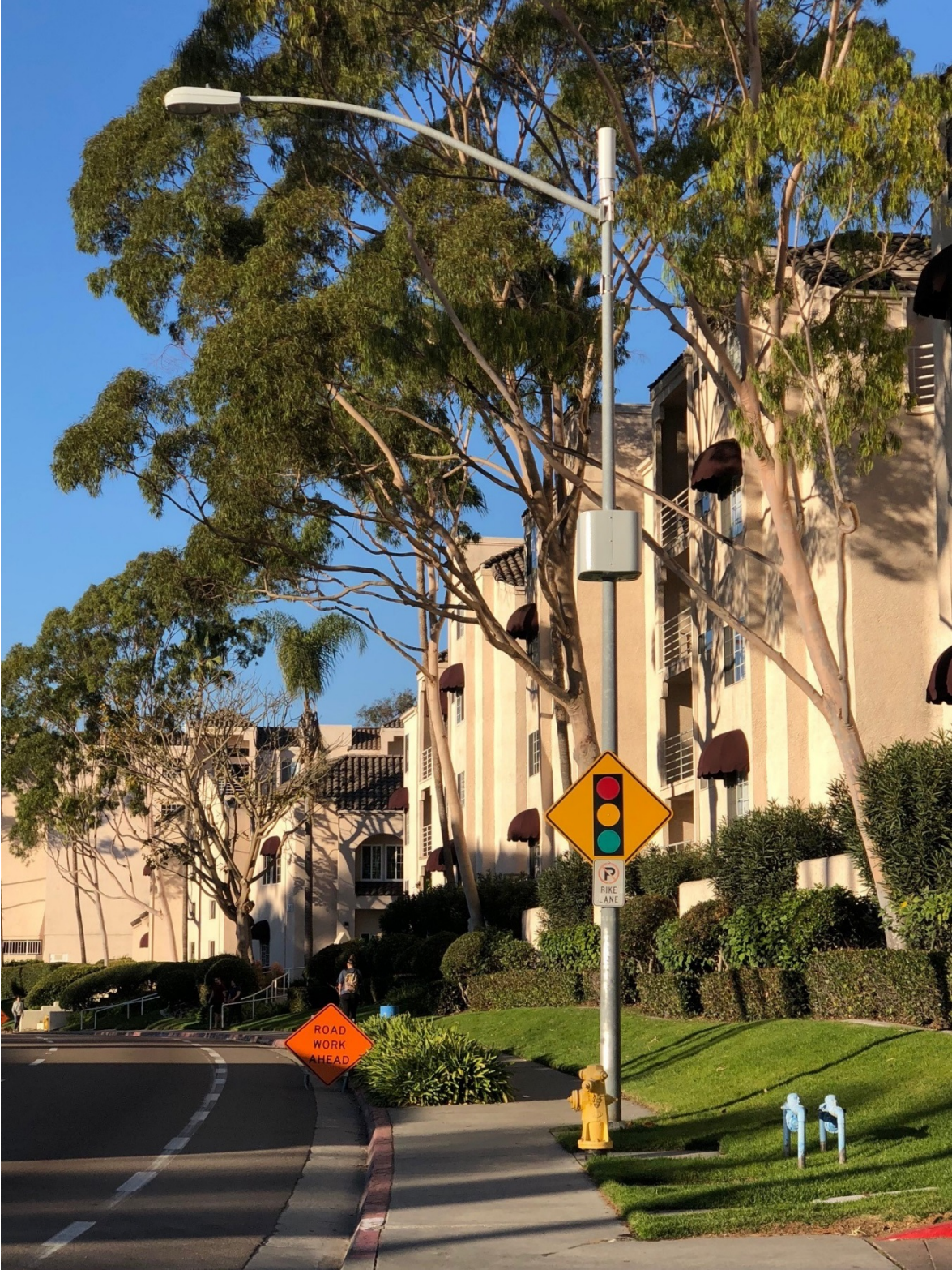
La Jolla Village Drive

inches from the pole in any direction, unless the antenna is top-mounted, then the antenna and/or shroud may extend up to 48 inches above the highest point of the cobra-arm mounted luminaire.