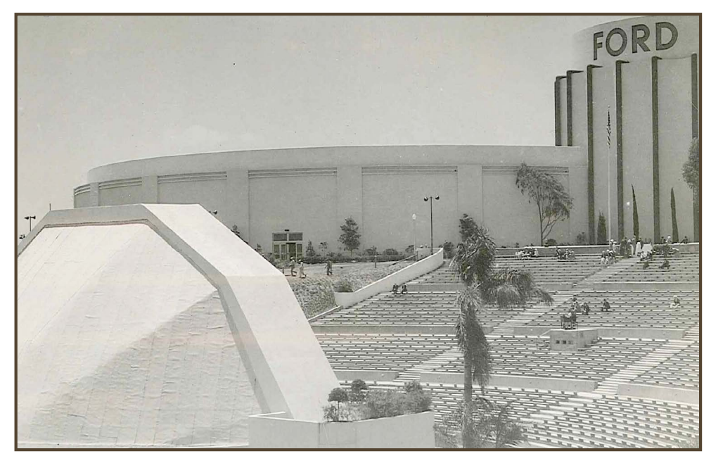
Amphitheater on canyon slope.