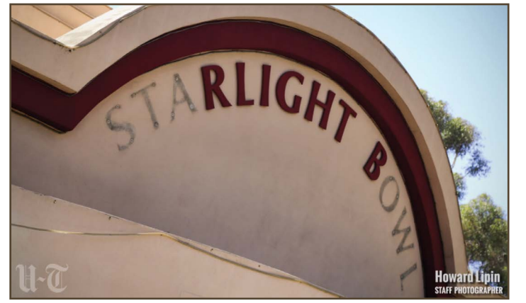
Sign says it all.

NONPROFIT ORG U.S. POSTAGE PAID SAN DIEGO, CA PERMIT #687