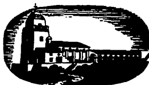
Junipero Serra Museum

NORTH SAN DIEGO, CALIF. September 29, 1937