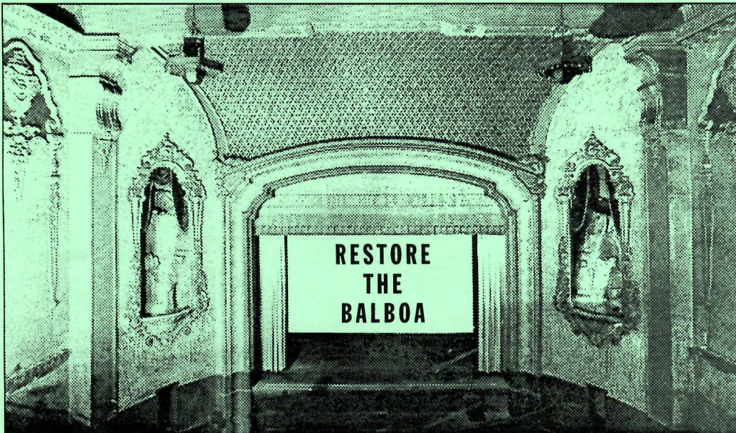
The stage of Balboa Theatre at Fourth and E, downtown San Diego. To join the Balboa Theatre Foundation, send your check for $10 individual annual membership or $100 corporate membership to P.O. Box 371461, San Diego, CA 92138 or call 619-466-2542.

Your help is needed. Call your local city council members and let them know that after more than a decade of non-use, you support restoring the Balboa as the centerpiece of downtown's revival.