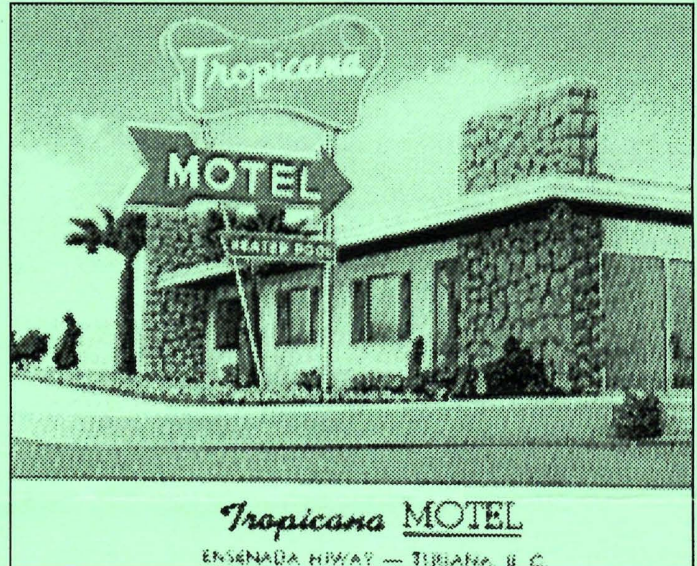
The Tropicana Motel in its prime, circa 1955.