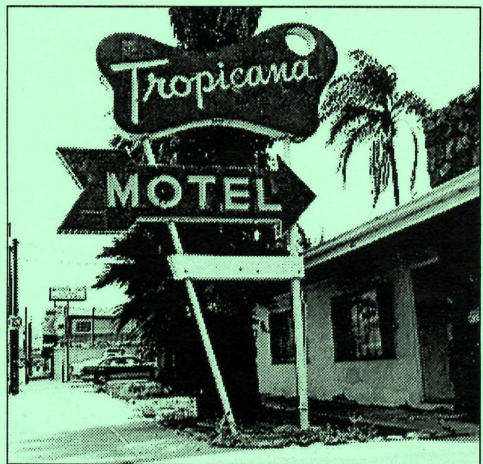
The Tropicana sign and motel shortly before the motel was demolished, 1996.