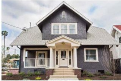
Rehabilitation of 1916 A.V. Walberg Residence with Attached Studio Unit