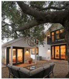
New Single Family Urban Infill with Granny Flat in rear yard and Native Oak Preserved