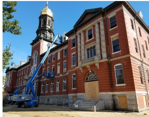
Deepening state historic tax credit incentives to encourage more affordable housing. Maine is one of several states that increases the percentage of state historic tax credits for projects that include affordable housing. The reuse of this 1906 former convent in Portland, Maine created 66 new affordable apartments.

Similarly, in 2019 the Oregon state legislature passed a bill (HB 2001) that requires