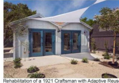
Rehabilitation of a 1921 Craftsman with Adaptive Reuse of the Original 1920's Garage into a Studio Apartment